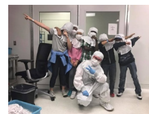
Students show off cleanroom gear.

Going deeper: We can work with you to tailor this experience and the type of samples students collect to fit in with your curriculum (botany, zoology, microbiology, geology, etc.). We can also make this a scientific exploration for students by having them construct a hypothesis and take samples to test it (e.g. is pollen from wind-pollinated species of plants smaller than insect-pollinated plants?).