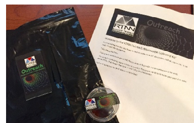
Collecting kit given to students.